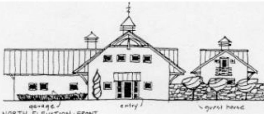
NORTH ELEVATION - FRONT TIMBER FRAME FARM